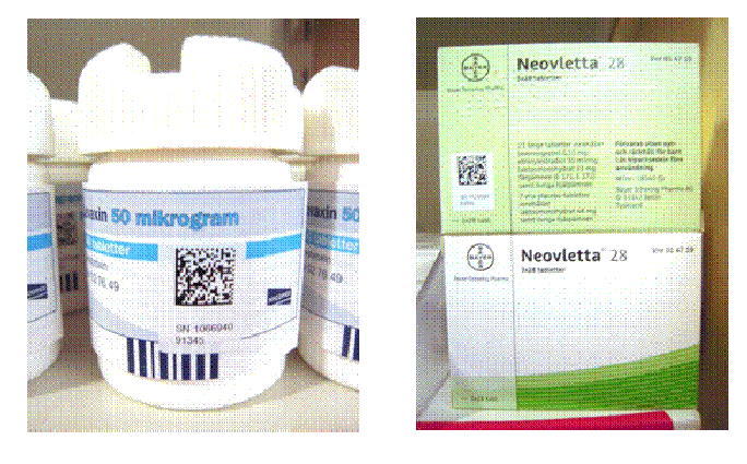
Figure 4 - Examples of Coded Packs

Packs coded were plastic bottles and folding boxes. The Data Matrix codes (DMC) were applied to the packs using self-adhesive labels on which the DMC was printed using thermal transfer printers. The pack's serial number is displayed next to the DMC in human readable form (see Figure 4).<sup>1</sup>