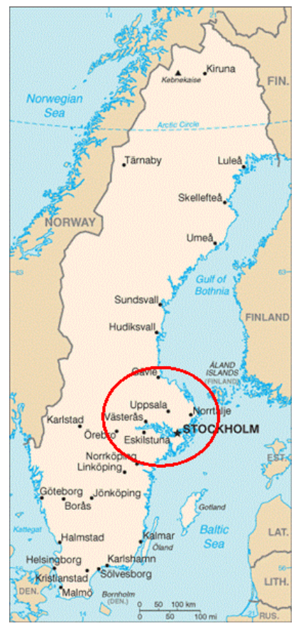
Figure 3 - Swedish region with Pharmacies participating in the EFPIA pilot

Fourteen pharmaceutical companies provided a total of 25 products for participation in the pilot. Section 3.2 provides a list of manufacturers who contributed some of their products to the project. It was the goal of EFPIA to have about 100,000 packs verified and dispensed during the duration of the operational phase of the pilot. The number of packs to be coded per product was determined based on the sales forecast for the targeted four-month period.