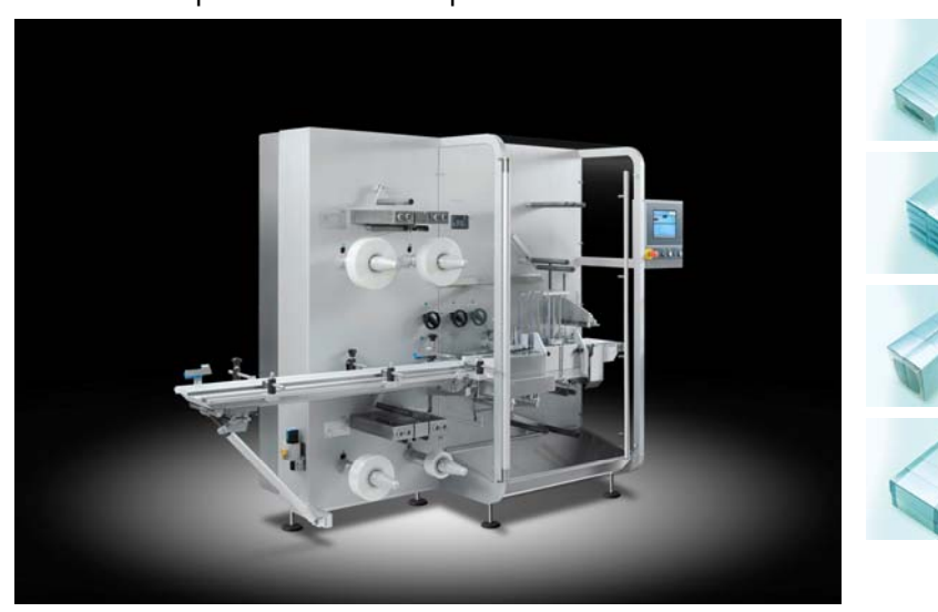
PEWO-pack 250 Compact stretch-wrapping machine

o pester pac automation: stretch-wrapping machine PEWO-pack 250 Compact with film-splicer