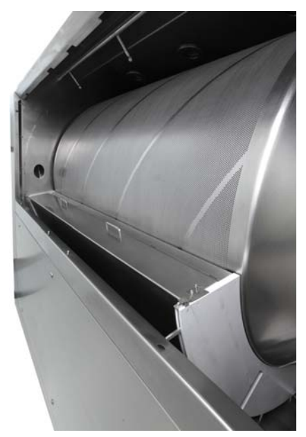
Three basic coating operations: spraying , drying and mixing . Every individual step must be carefully optimized in coordination with the others.